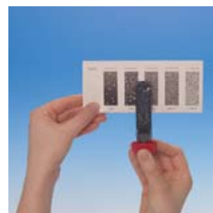
Interpretation of results